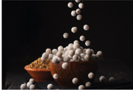
Calcutta Jeera goli