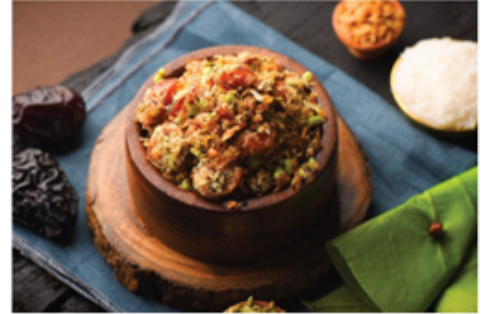
Paan King Mukhwas